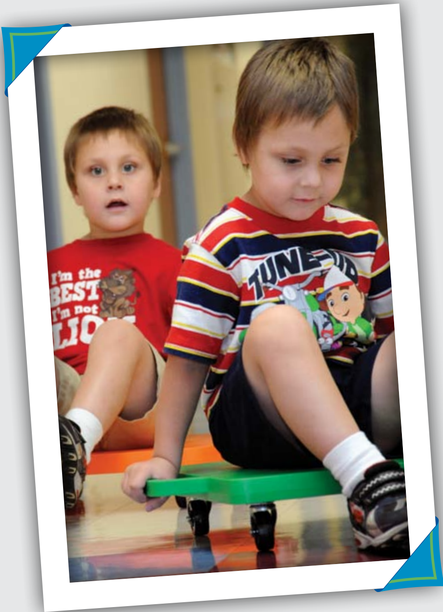
Is Isaiah Petrolay